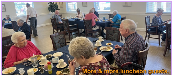
More & more luncheon guests.