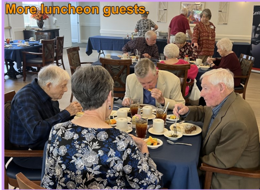
More luncheon guests.