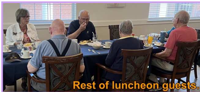
Rest of luncheon guests.