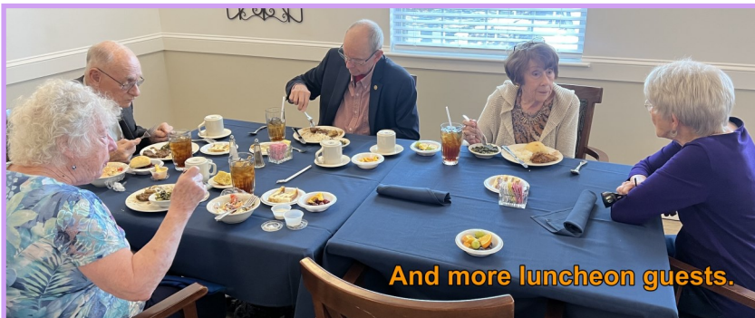
And more luncheon guests.