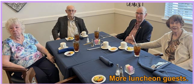
More luncheon guests.