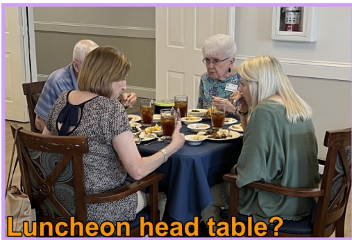
Luncheon head table?