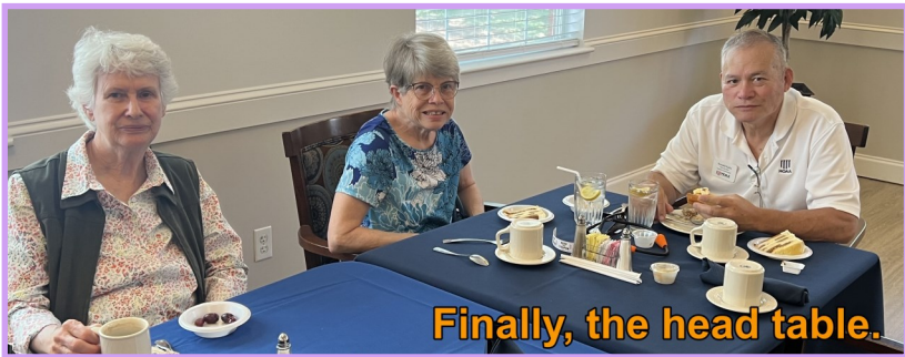
Finally, the head table.